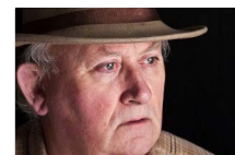
Billionaire Tells Americans to Moneynews