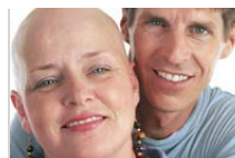
5 Signs You'll Get Cancer Newsmax