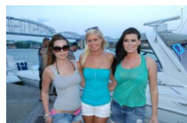
Party in the Park: June 12