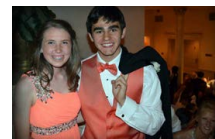
Moeller High School prom gallery